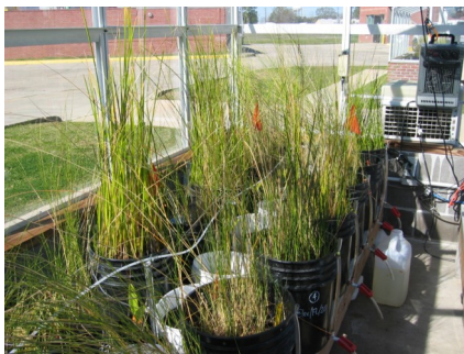
Figure 5. Mesocosms receiving elevated CO 2 in the greenhouse study.

Once transported back to the greenhouse, the plugs of wetland plants and soil were placed in containers called mesocosms (Fig. 5) and exposed to either ambient CO 2 levels or elevated CO 2 levels (twice as high as current levels). They were also randomly assigned to a range of salinity levels (fresh to higher than normal), and water levels (drained, intermittently flooded, and constantly flooded). We then measured plant growth and rates of soil building (Figs. 6, 7) for the different combinations of environmental conditions.