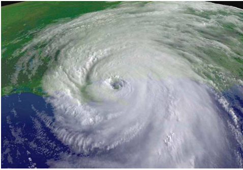
Hurricane Katrina, August 29, 2005