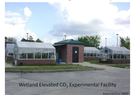
Figure 4. Greenhouses used in elevated CO 2 studies.

In one such study, my collaborators and I collected plugs of soil and plants (Fig. 3) and transferred them to greenhouses in the Wetland Elevated CO 2 Experimental Facility in Lafayette, Louisiana, USA (Fig. 4). We collected plugs from a brackish wetland located in Big Branch Marsh National Wildlife Refuge near Lacombe, Louisiana. Two species dominated the wetland plant community. The first was three-square bulrush, a C-3 plant that is relatively flood-tolerant, but less salt-tolerant. The second was saltmeadow cordgrass, a C-4 species that is relatively salt-tolerant, but less flood-tolerant. Based on what is known about the two dominant species, we were able to make some predictions of how these plants would respond to different levels of CO 2 , flooding, and salinity.