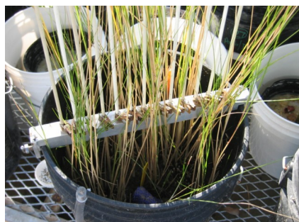
Figure 6. Measuring vertical soil building in a mesocosm.

The range of vertical soil building observed in the greenhouse experiment was similar to that observed in two Louisiana brackish marshes. In addition, a field experiment testing effects of CO 2 and nutrient additions on a Chesapeake Bay brackish marsh found that CO 2 enhanced plant production and stimulated soil building.