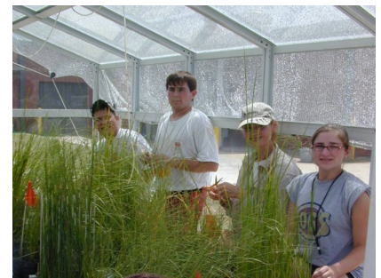
Figure 7. Collection of plant data from mesocosms in the greenhouse study.

Experiments designed to investigate the effects of CO 2 on coastal wetlands have the potential to contribute a great deal to our understanding of wetland responses to climate change. Results of studies to date reveal that CO 2 can stimulate plant production and vertical soil building, but the extent of this response will vary depending on the types of plants and the other environmental conditions in the wetland. Because multiple factors interact to influence plant responses in nature, there is still a lot to learn about the effects of elevated CO 2 on coastal wetlands and their capacity to keep pace with sea-level rise.