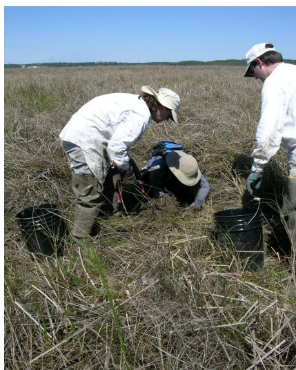
Figure 3. Collection of plant and soil plugs from a brackish marsh.

Nature is complex and ever-changing, with multiple environmental changes occurring at once. Wetland plants are not given the opportunity to respond to one thing at a