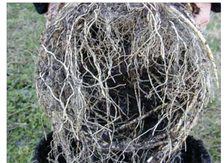
Figure 2. Root growth can be substantial and contribute to vertical soil building.

Thus, CO 2 may positively affect plant responses important for vertical soil building and may help prevent wetlands from being overtopped by rising seas.