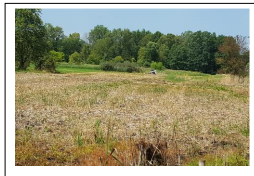
Cutting and herbicide spraying of hybrid cattail, common reed, and reed canary grass in August 2017.