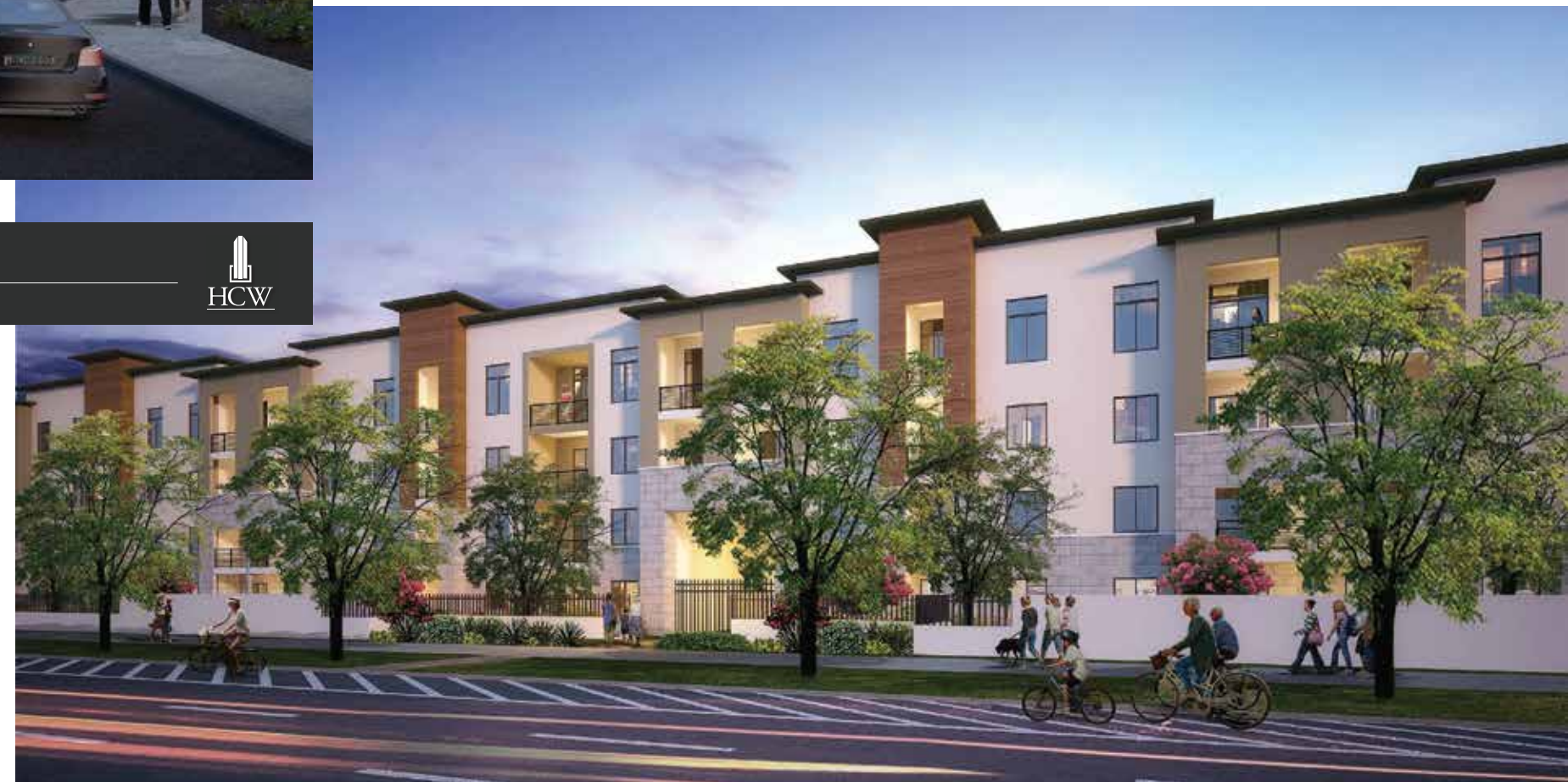
4 STORY LUXURY APARTMENT DEVELOPMENT RENDERING

Cell: 480.620.4738 brandon.vasquez@dpcrc.com