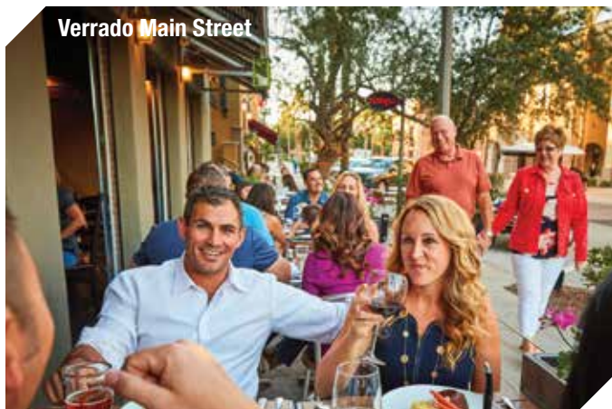
Verrado Main Street