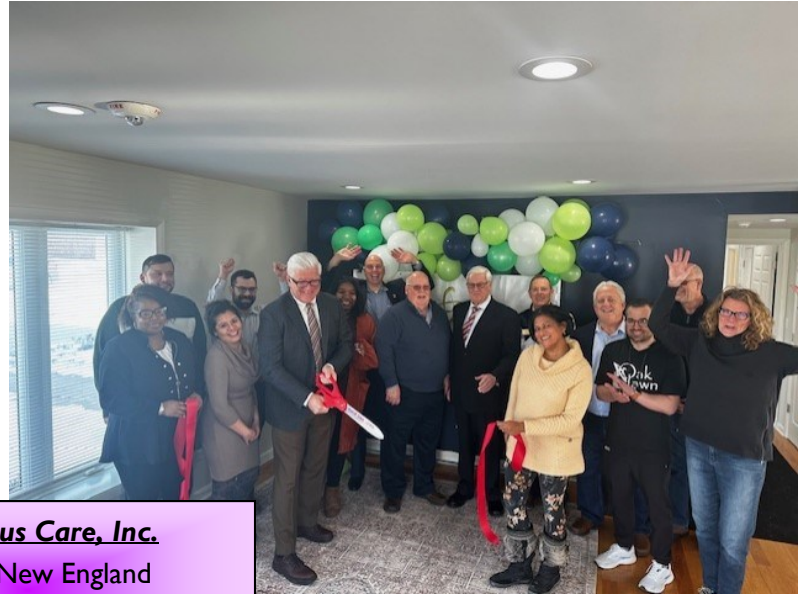
BEDS Plus Care, Inc. 9501 S. New England Oak Lawn