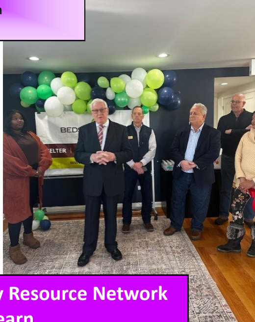
D123 Community + Family Resource Network Lunch & Learn