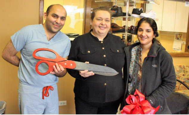
Ribbon Cutting ~ Foot & Ankle Health Center