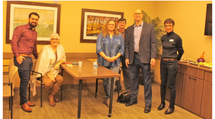
Business After Hours ~ DGK Realty