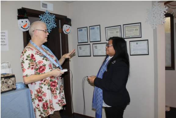
Jason Deli Ribbon Cutting