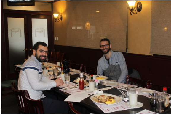
BAH ~ Cognitive Clinic