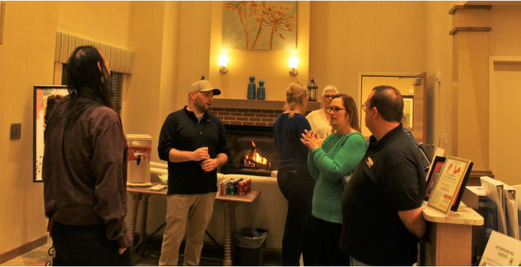
BAH ~ Gracepoint