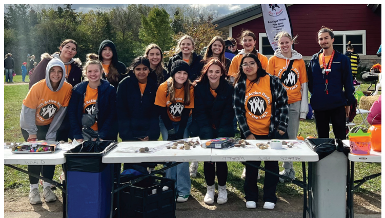
Youth Action Hudson at the YMCA helped kids decorate their pumpkins! ■