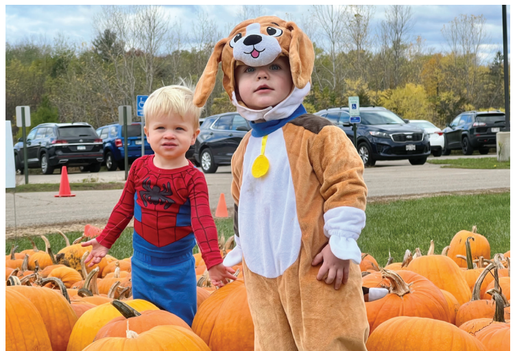
Scooby-Doo and Spiderman checking out the Pumpkin Patch! All kids received one free pumpkin to decorate, thanks to Minuteman Press – Hudson.

Thank you, Hudson EMS, Police, and Fire, for displaying your vehicles for the kids to interact with.