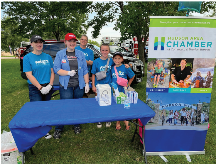
Thank you to the Hudson Police Department for organizing National Night Out. We were excited to be there serving root beer floats. Thank you to the Angel's Pet World team for volunteering at the event, to Knoke's Chocolates & Nuts for donating the ice cream, and to Lucky's Wine & More for donating the root beer. ■