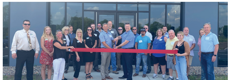
Hunt Electric dba Baer Manufacturing - located at 924 Daily Rd., Hudson. Industry leading manufacturing and fabrication that provides value to customers and clients. For more information, call 715-598-8845. For Hunt Electric, click here . For Baer Manufacturing, click here .