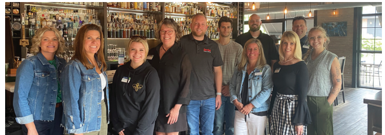
The Hudson Chamber Ambassadors recently paid a visit to LoLo American Kitchen & Craft Bar Hudson for their June meeting. LoLo American Kitchen & Craft Bar Hudson is locally owned and operated, featuring gourmet street food and hand-crafted artisanal cocktails. Their Hudson location also contains a private speakeasy-style event space, suitable for special events and private parties. For more information, call (715) 808-8025 or click here .