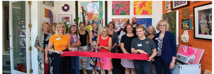
Cream of the Crop Artists Gallery - located at 511 2nd St., Ste. 102, Hudson. Curating artwork for your home or business. For more information, call (715) 338-6766 or click here .