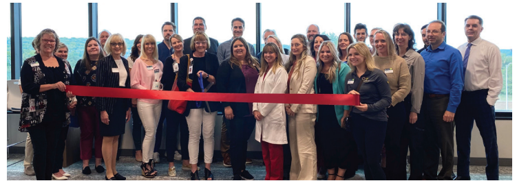
Valley Surgery Center – located at 2651 Hillcrest Dr., Ste. 301, Hudson. Surgical excellence, compassionate care. For more information, call (715) 952-1279 or click here .