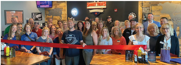
Smokey Treats – located at 131 Carmichael Rd. #105, Hudson. Not your typical BBQ, global and regionally inspired dishes, grilled burgers, and more. For more information, call (715) 222-1299 or click here .