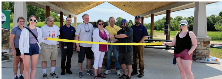
Vista Prairie Campground – located at 1049 Rustic Rd. #3, Glenwood City. Nestled among the hills surrounding Glen Lake near the middle of the day-use area of Glen Hills County Park, there are 15 beautiful new sites available. This area may also be used as a group area for weddings, family reunions, or youth events. For more information, click here .