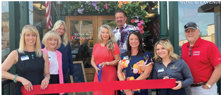
Rose & Lavender – located at 220 Locust St., Hudson. Perfect gift and home décor for any occasion. For more information, click here .