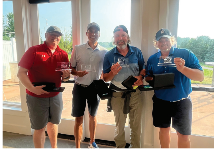
Members of the winning team proudly displayed their trophies.

We look forward to seeing you on the course in 2024!