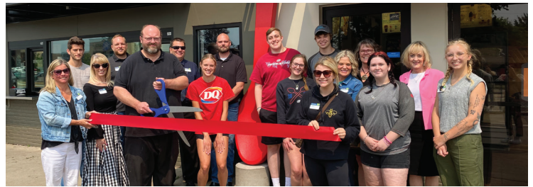
Hudson Dairy Queen - located at 9 South 2nd St., Hudson. Soft serve ice cream treats and a full food menu. Be sure to stop in to check out their newly remodeled space and take your picture with the 12-foot spoon outside! For more information, call (715) 386-6326 or click here .