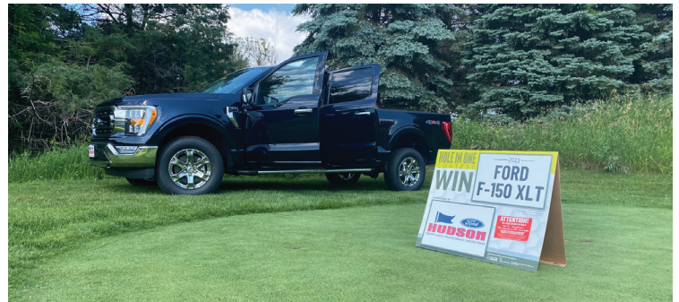
Golfers had the opportunity to participate in a Hole-in-One Contest in efforts to win a 2022 Ford F-150 Supercrew sponsored by Hudson Ford LLC and Quick Lane. ■