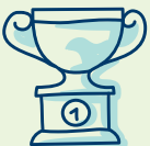
Best Hole Contest Winner: Boldt's Plumbing & Heating Inc.