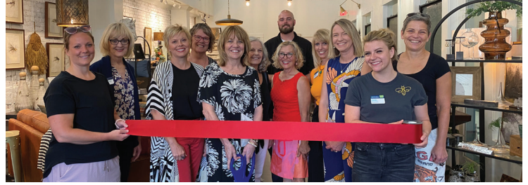
ABOUT HOUSE - located at 509 2nd St., Hudson. Down to earth furnishings for your home. For more information, call 715-381-8175 or find them through their store, The 715 .

If you know of a great Chamber Brand Champion, let us know so we can recognize them and award them $25 in Chamber Checks! ■