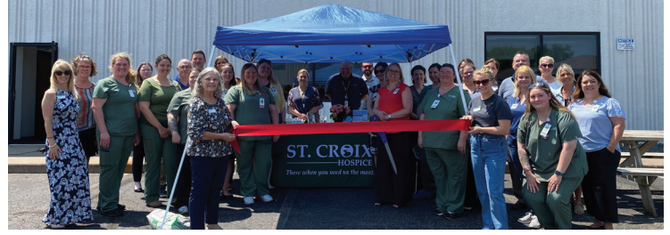
St. Croix Hospice Hudson, Wis. Branch – located at 642 Brakke Dr., Hudson. With a focus on comfort and quality of life, our hospice teams across the Midwest provide care with dignity and respect. For more information, call (715) 690-1011 or click here .