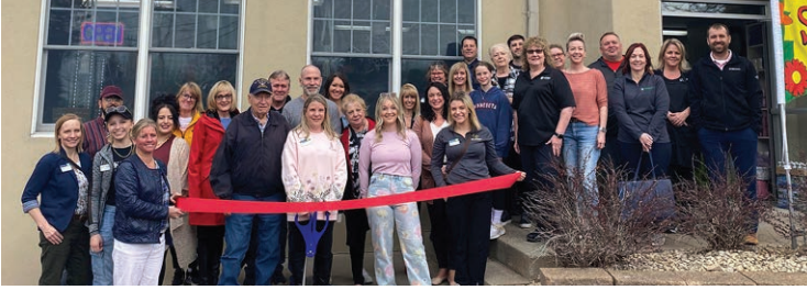
Blooms for Happiness – located at 123 W Cascade Ave., River Falls. Satisfying all your floral needs in-store, online + delivery. For more information, call (715) 961-0504.