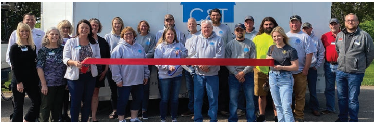
C & T Siding – located at 103 Packer Dr., Roberts. Making your house feel like a home with high-quality siding and windows installed and finished to match the aesthetic of your home. For more information, call (715) 749-3991.