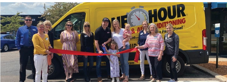
One Hour Heating and Air Conditioning of Western Wisconsin – located at 573 County Rd. A, Ste. 107, Hudson. Locally owned and operated heating and air conditioning maintenance and repair service with professional technicians providing on-time, 100% satisfaction guaranteed service to homeowners in Western WI. For more information, call (715) 245-2888.