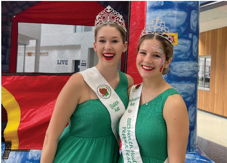
Volunteers from the North Hudson Pepper Fest Royalty had a blast interacting with kids in the bounce house, and even participated in some face painting! ■