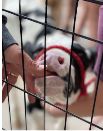
Attendees had an a-moozing time visiting with an array of furry friends courtesy of Lucky Paws Midwest Inc.

On May 18, locals & visitors alike had the opportunity to explore local activities, offers, and specials all while supporting Hudson businesses through our Explore Your Hudson event. Participants took advantage of special offers as they became a tourist in their own town and made connections with the local businesses. To wrap up the day, Jonesy's Local Bar & Grill held an after party where grand prize winners were drawn. Fun was had by all who were involved!