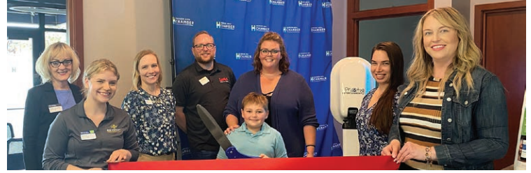
Photog Entertainment – located in Hammond, WI. Sleek open air photo booth, keep your guest captivated and entertained all while enjoying the moments that turn into memories. For more information, call (715) 222-0632.