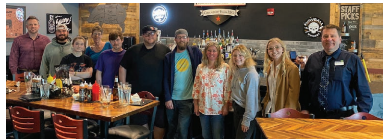
The Ambassadors also visited Smokey Treats for their May meeting. Ambassadors had the opportunity to meet and converse with various staff members, specifically honing in on their recent experience as a food vendor at the Hudson Community Expo. For more information, call (715) 222-1299. ■