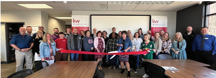
Keller Williams Integrity Realty WI/MN – relocated to 1610 Maxwell Dr., Ste. 150, Hudson. Their Keller Williams REALTORS® are ready to help you with all your real estate needs, and appreciate the opportunity to earn your business. For more information, call (952) 412-2342.