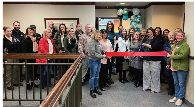
St. Croix Valley Sexual Assault Response Team, Inc. – located at 1200 Hosford St., Ste. 300, Hudson. St. Croix Valley SART provides forensic healthcare and advocacy to individuals of any age. For more information, call (715) 425-6443. ■