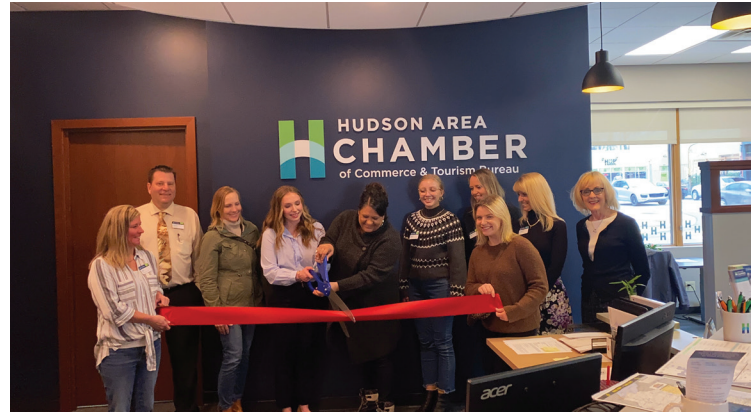
Positivity Planters – Making a positive and sustainable impact on others in our community through kindness, acts of service, and funding. For more information, call (715) 410-0589.