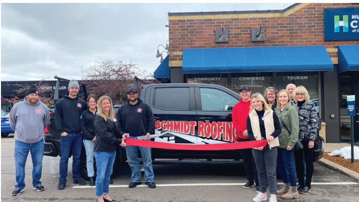
Schmidt Roofing, Inc. – located at 206 2nd St., Ste. D, Hudson. Contact Schmidt Roofing, Inc. for all of your roofing siding, window and gutter needs – both residential and commercial. For more information, call (715) 350-7127.