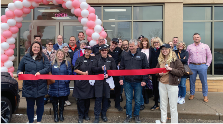
Crumbl – Hudson – located at 1020 Pearson Dr., Hudson. National Cookie Franchise “bringing family and friends together over a box of the best cookies in the world” here in Hudson, Wisconsin. For more information, call (715) 280-9800.