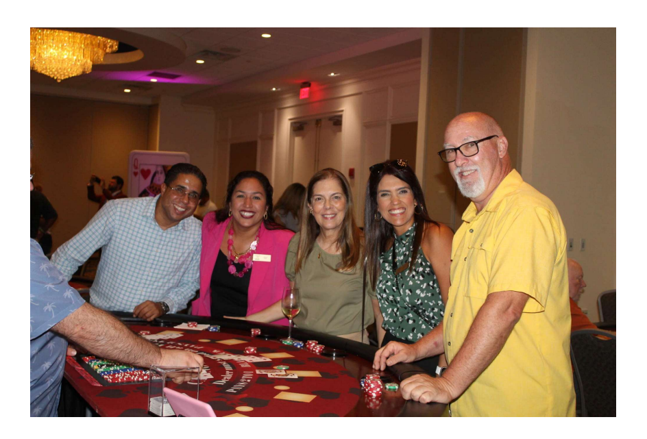
CFHLA would like to extend a Big Thank You to our Sponsors including:

The net proceeds from this fundraising event will be utilized to support the CFHLA Foundation and the initiatives of CFHLA Security & Safety Council, including the continued support of our local law enforcement and first responders, as well as hospitality security employees who go above and beyond" in guest safety services.