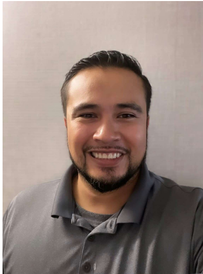
Milton Castellanos Hyatt Place Orlando I- Drive/Convention Center