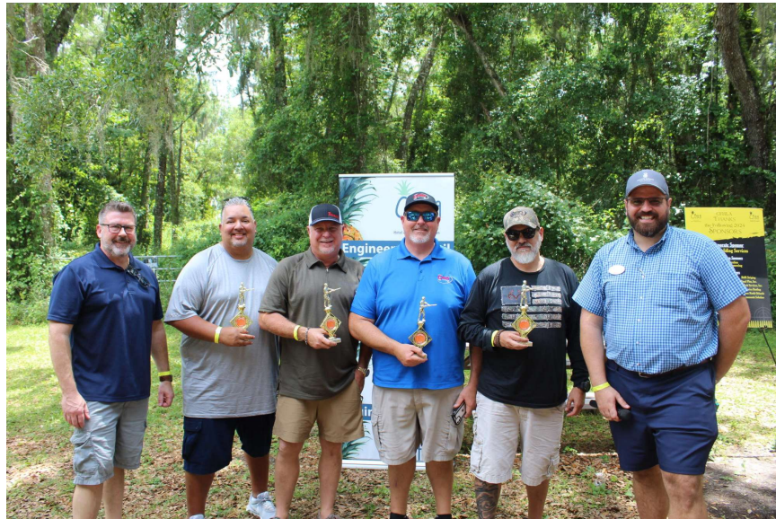
2nd Place Team