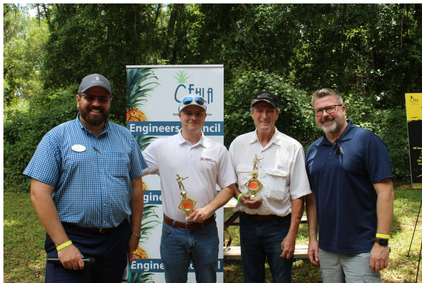
3rd Place Team