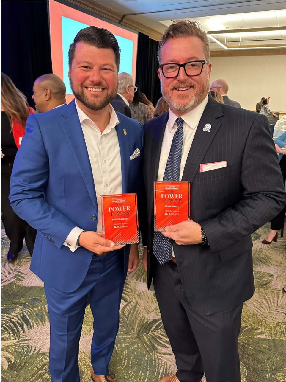
Lifeboat Project Yacht Rock Gala