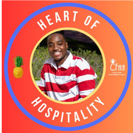
Thaddaeus Watkins Marriott's Cypress Harbour