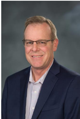
John McCracken Marriott Village Orlando