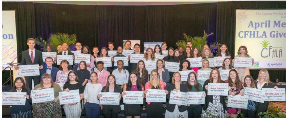
2023 Hospitality Student and Family Member Scholarship Honorees

The CFHLA Foundation was also PROUD TO ANNOUNCE that since 2000, we have AWARDED more than $1,200,000 in hospitality student scholarships!