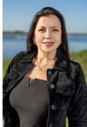
Zugheily Reyes Clean Tec Services