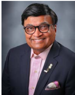
R.P. Rama Holiday Inn Orlando International Airport