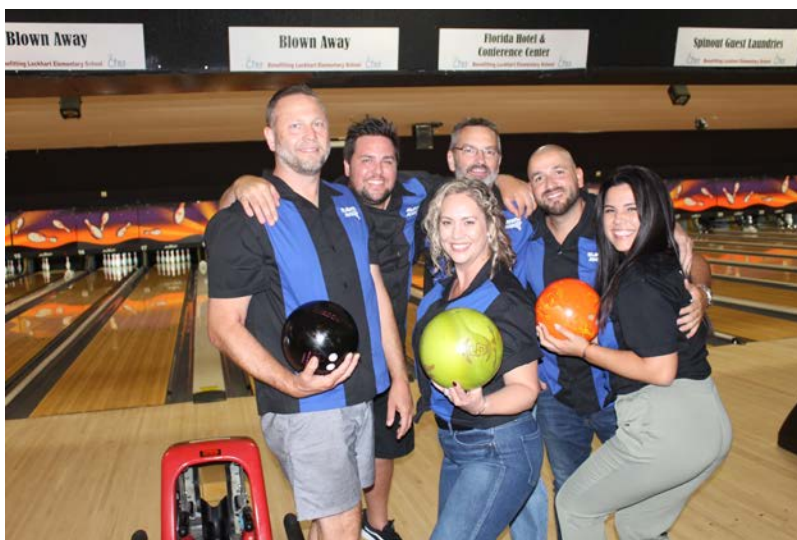
Blown Away Team