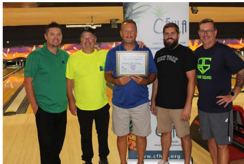
Comprehensive Energy Services Team

CLICK HERE TO VIEW PHOTOS FROM THE FUNDRAISER