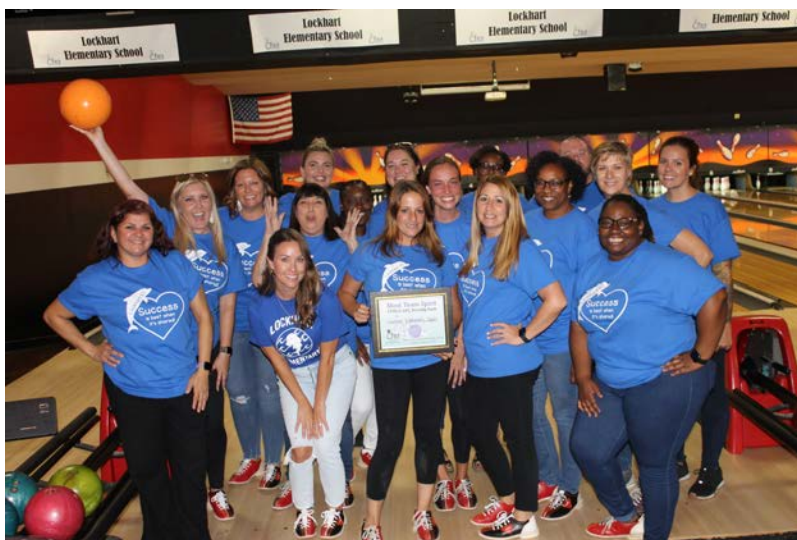
Lockhart Elementary School Team