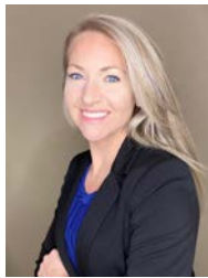
Chelsea Wynn Holiday Inn Club Vacations Orange Lake