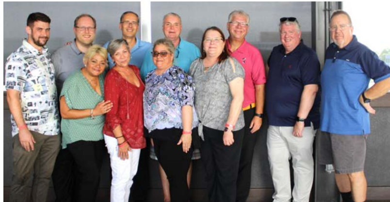
Wyndham Lake Buena Vista Disney Springs Resort Area Teams