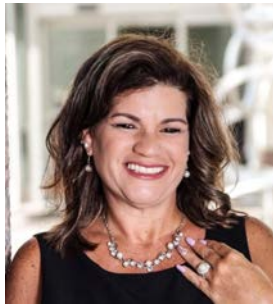
Vanessa Faberle Hampton Inn & Suites Orlando Airport at Gateway Village / Homewood Suites by Hilton Orlando Airport at Gateway Village