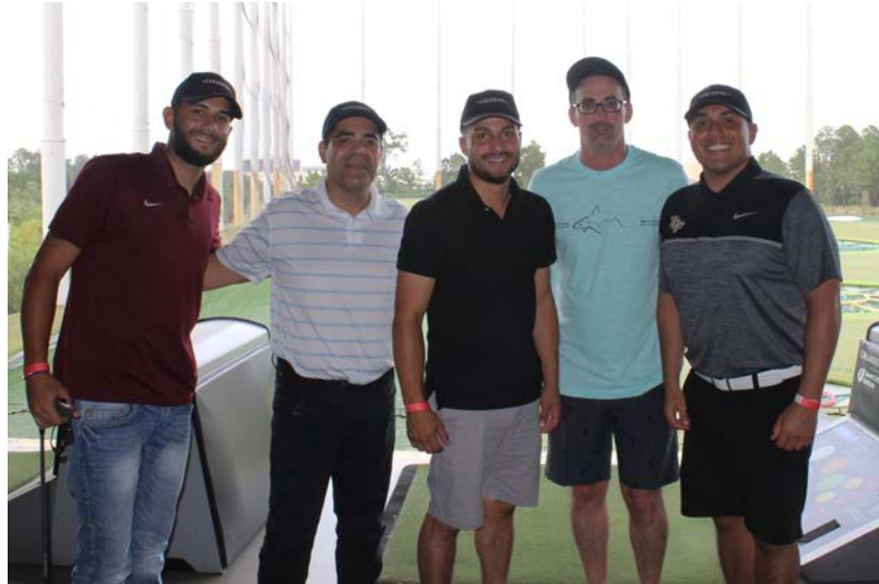
Celeste Hotel Orlando Team