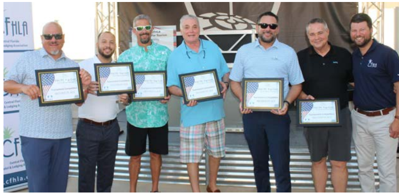
Third Place Team: Crown Linen