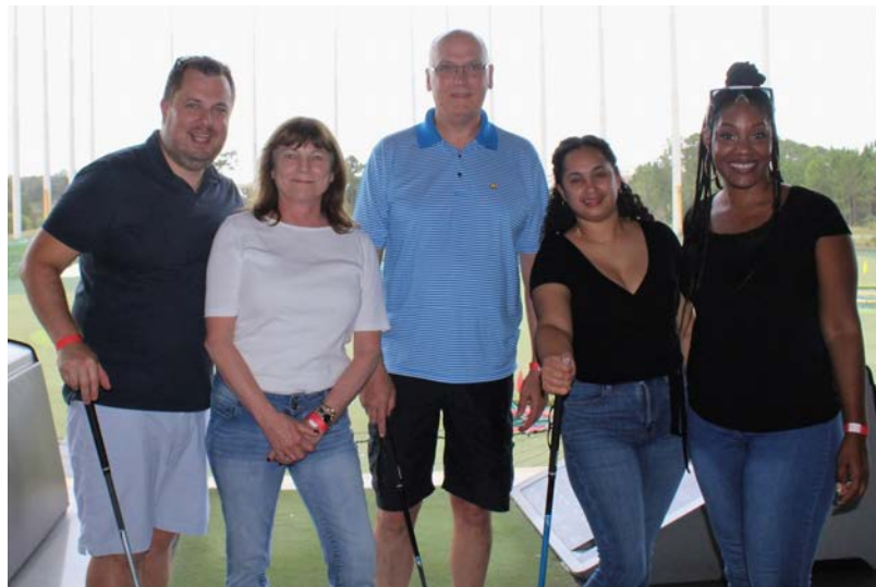
Florida Hotel & Conference Center Team

To view the entire photo album, please CLICK HERE .