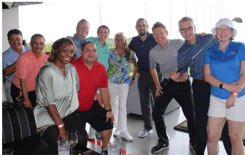
Sheraton Vistana Resort Teams