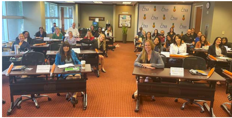
HR Seminar #1 attendees