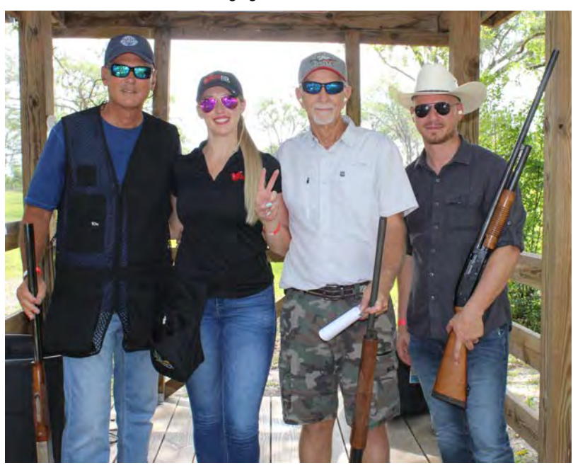
Below you'll find additional photographs from this event: