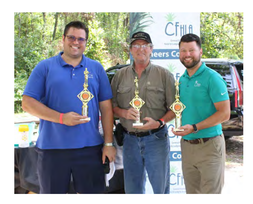
3rd Place Team RAM Striping