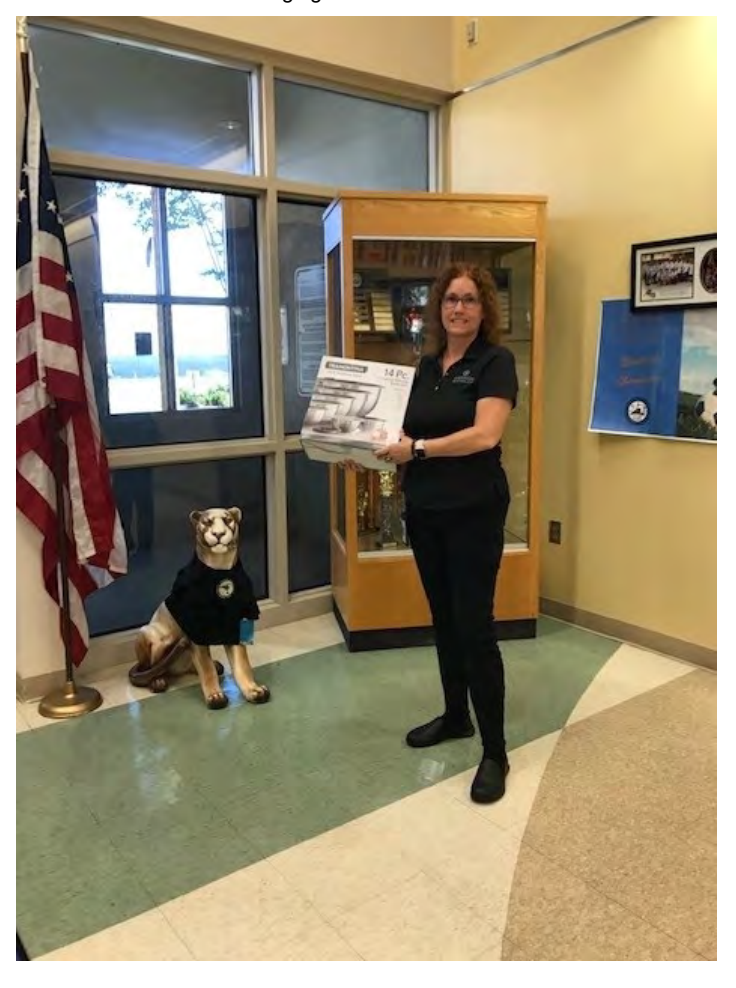
Central Florida Hotel and Lodging Association - Administration

The <u>Waldorf Astoria Orlando</u> hosted teachers from Lake Buena Vista High School. Those that attended relaxed and enjoyed a selection of food and adult beverages.