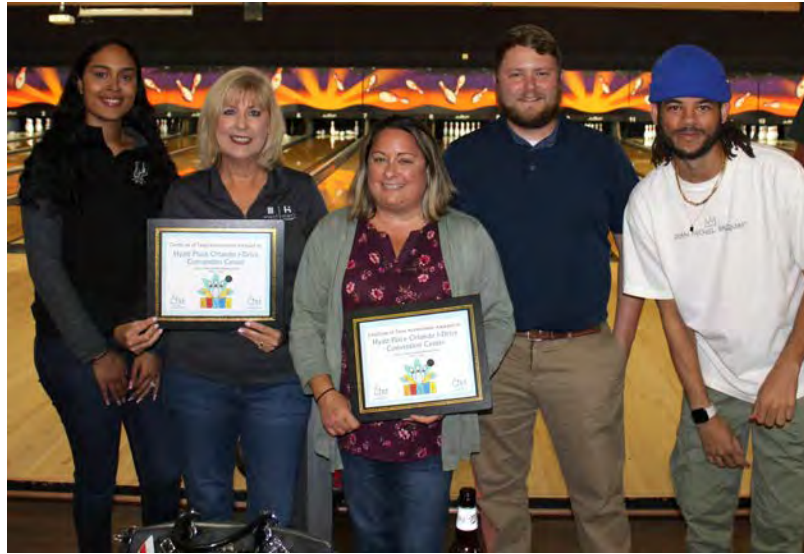
Hyatt Place Orlando I-Drive Convention Center Teams