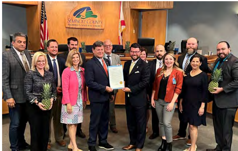
Seminole County Proclamation in partnership with Do Orlando North