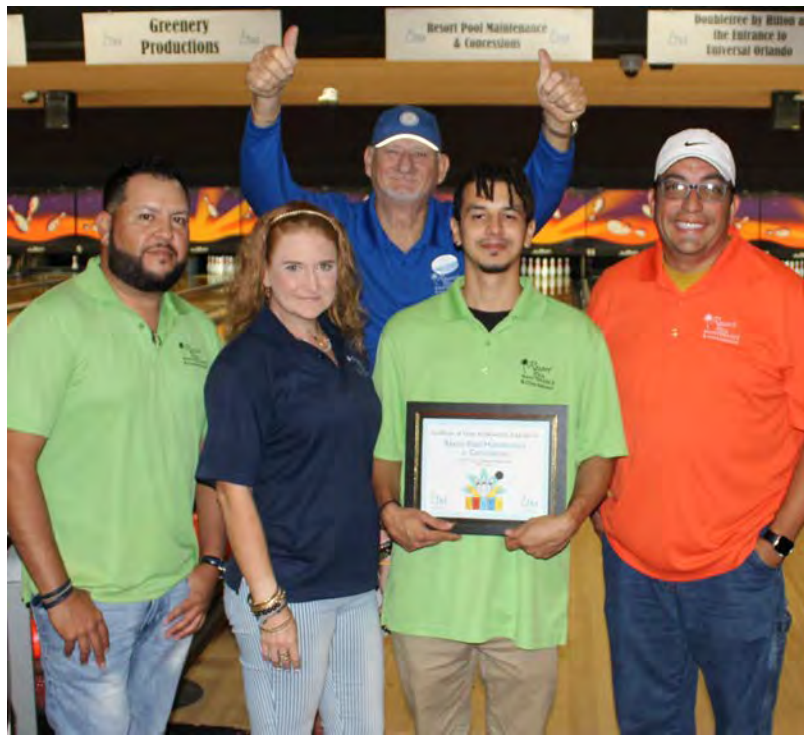
Resort Pool Maintenance & Concessions Team

TO VIEW THE ENTIRE EVENT ALBUM, PLEASE CLICK HERE.