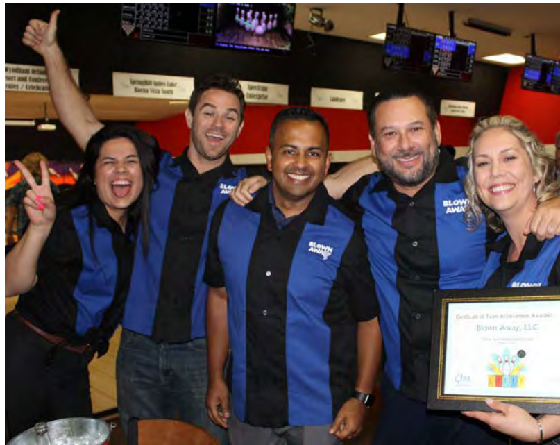
Blown Away Team - Silver Partner Member