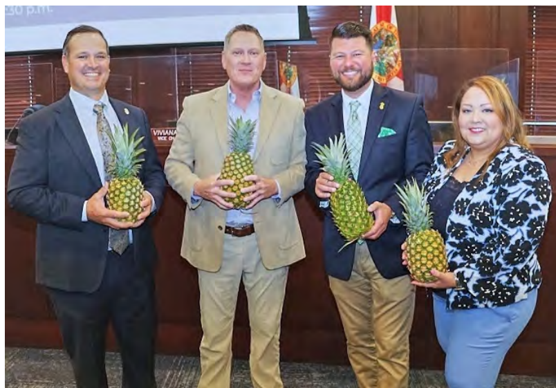
Osceola County Proclamation