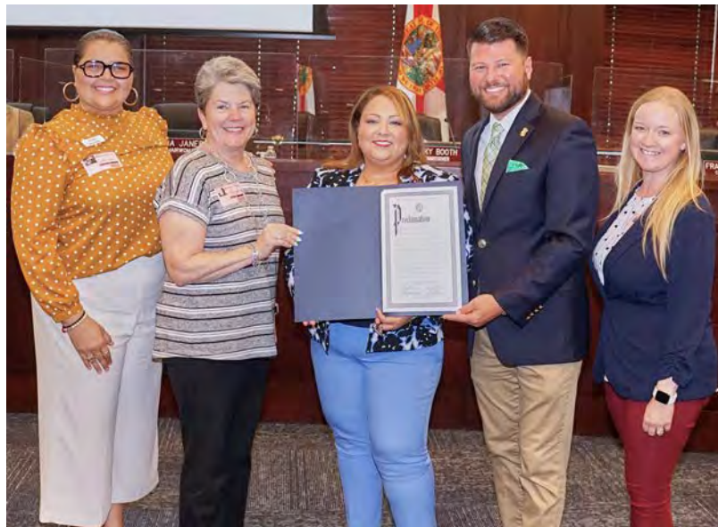
Osceola County Proclamation in partnership with Experience Kissimmee