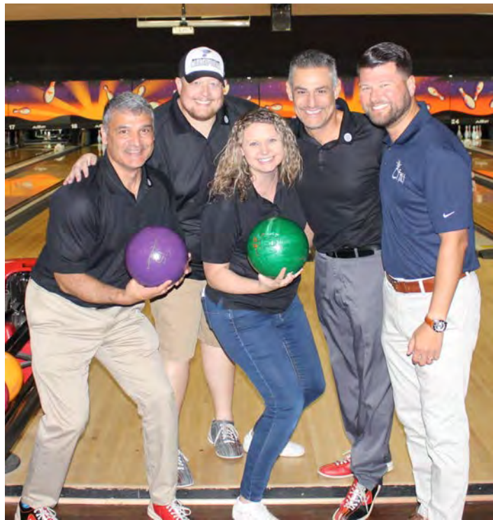
Global Sourcing International Team - VIP Member