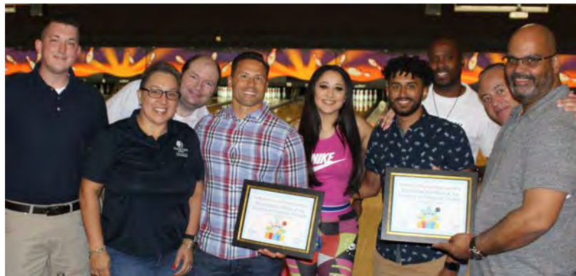
DoubleTree by Hilton at the Entrance to Universal Orlando Team

Below you'll find additional photographs from this event: