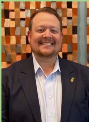
Clint Militzer Aloft Orlando I-Drive / Element Orlando I-Drive