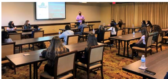
Marriott's Lakeshore Reserve hosted students from Windermere High School