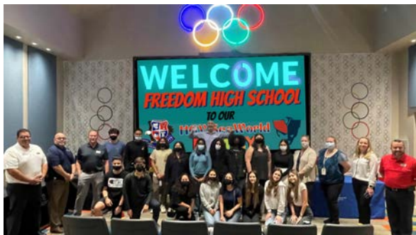
Hilton Grand Vacations at SeaWorld hosted students from Freedom High School