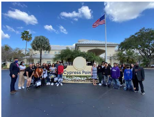
Cypress Point Resort hosted students from Colonial High School