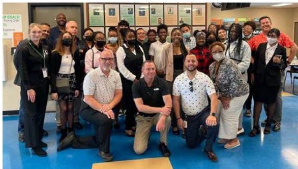
Holiday Inn Club Vacation at Orange Lake Resort hosted students from Oak Ridge High School and OTC Mid Florida