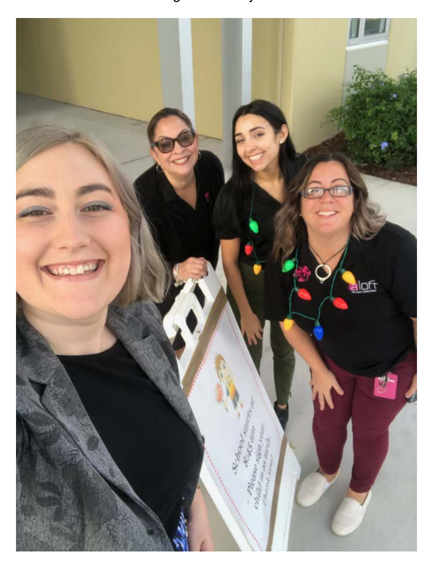
Thank you Aloft Orlando Downtown for your partnership and support of Orange County Public Schools!

We are thankful for the team at Aloft Orlando Downtown, who volunteered for their Adopt-A-School partner, Pershing Elementary School.