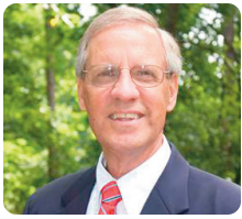
Ashley Curry, Mayor City of Vestavia Hills