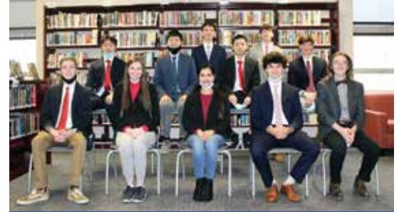
We the People at Vestavia Hills High School

so grateful for the students' efforts and could not have been happier with the manner in which they represented themselves