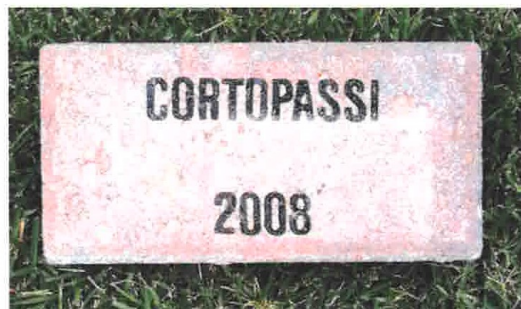
4" x 8" brick

Your gift of $75 will place one engraved 4"x 8" brick around the Temple, creating a charming walkway for visitors. Make as many contributions as you like; these gifts are tax-deductible to the full extent allowed by law.