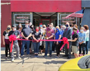
REIDSVILLE TRADING POST