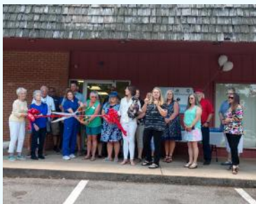
BEAUTIFUL PETS GROOMING TOO