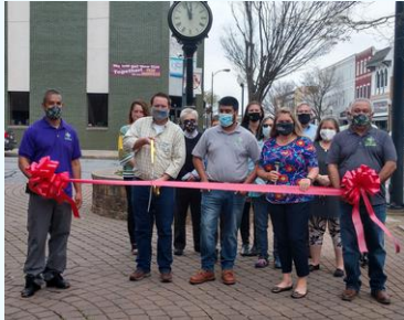
GARCIA FENCE INC.