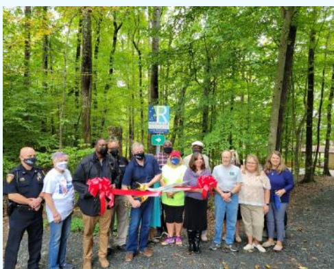
THE DAN RIVER BASIN ASSOCIATION