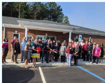
VOCATIONAL REHABILITATION SERVICES