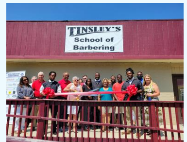
TINSLEY'S SCHOOL OF BARBERING