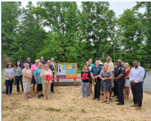
LAKE REIDSVILLE BLUEWAY ACCESS