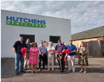
HUTCHENS RENTZ EDEN OIL