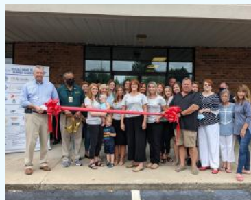
CLASSIC CUT SALON