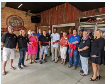
LUCKY CITY BREWING