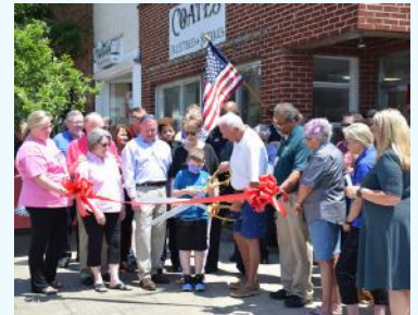
COATES COLLECTIBLES & ANTIQUES