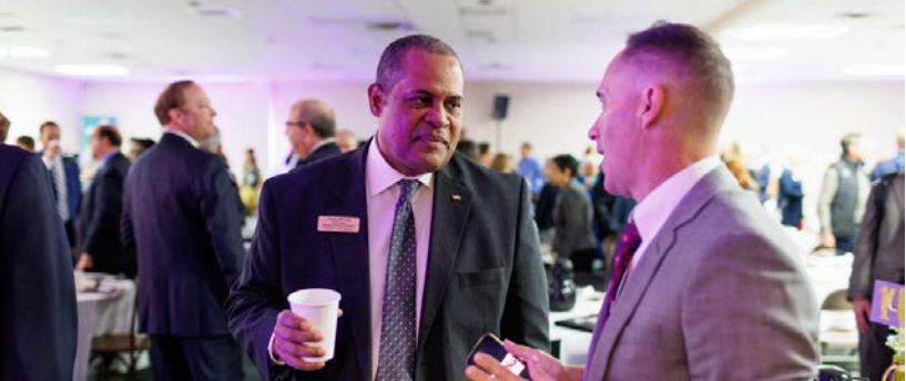
TABLE PARTNER* | $1,200