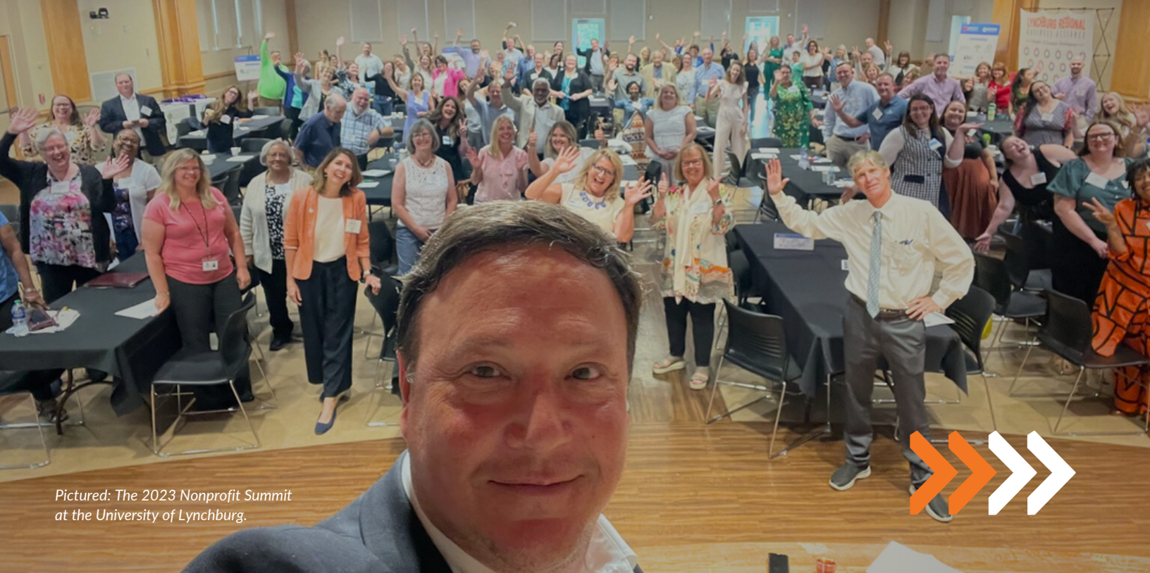
Pictured: The 2023 Nonprofit Summit at the University of Lynchburg.

Exclusive sponsorship, marketing & advertising opportunities