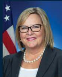
Senator Judy Ward