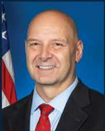
Senator Doug Mastriano

JOIN THE FRANKLIN COUNTY CHAMBERS OF COMMERCE FOR A LEGISLATIVE BREAKFAST FEATURING OUR STATE ELECTED OFFICIALS DISCUSSING IMPORTANT ISSUES AFFECTING THE BUSINESS CLIMATE IN SOUTH CENTRAL PENNSYLVANIA.*