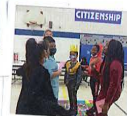
Games & Teamwork