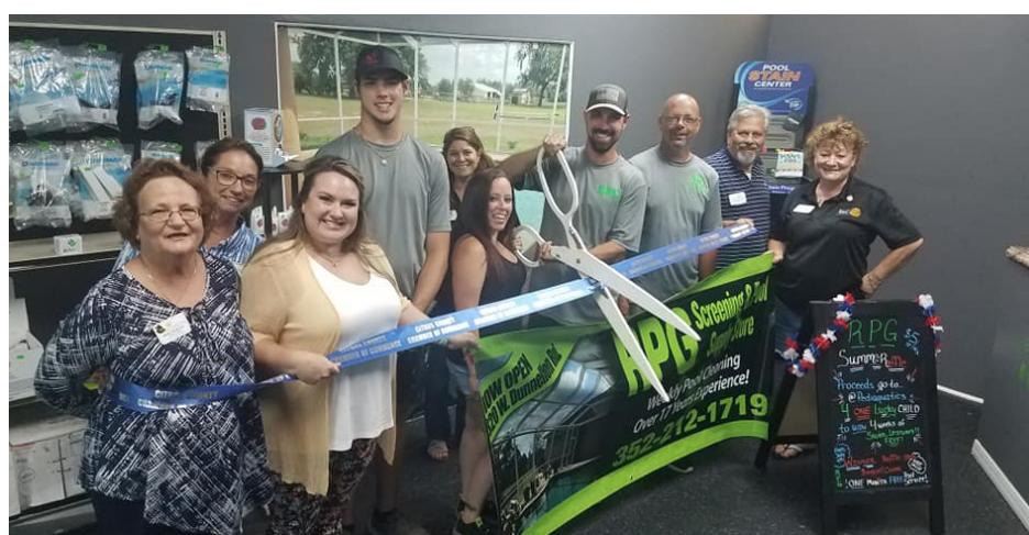
Welcome to the Chamber, RPG Screening and Pool Service! 2820 W Dunnellon Rd, Dunnellon. RPG Screening is an independent company to clean & repair your patio, pool, or other screened enclosures. Great prices, fast available service, and free estimates in Tri-County Area of Citrus and Dunnellon, FL.

RPG Screening and Pool Services 352-212-1719