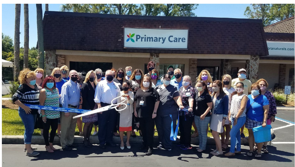
Welcome to the Chamber Bayfront Health Medical Group - Citrus Hills. 2400 N Essex Ave, Hernando. The health care professionals at Bayfront Health Medical Group are dedicated to keeping you and your family healthy.

Bayfront Health Medical Group 352-513-4276