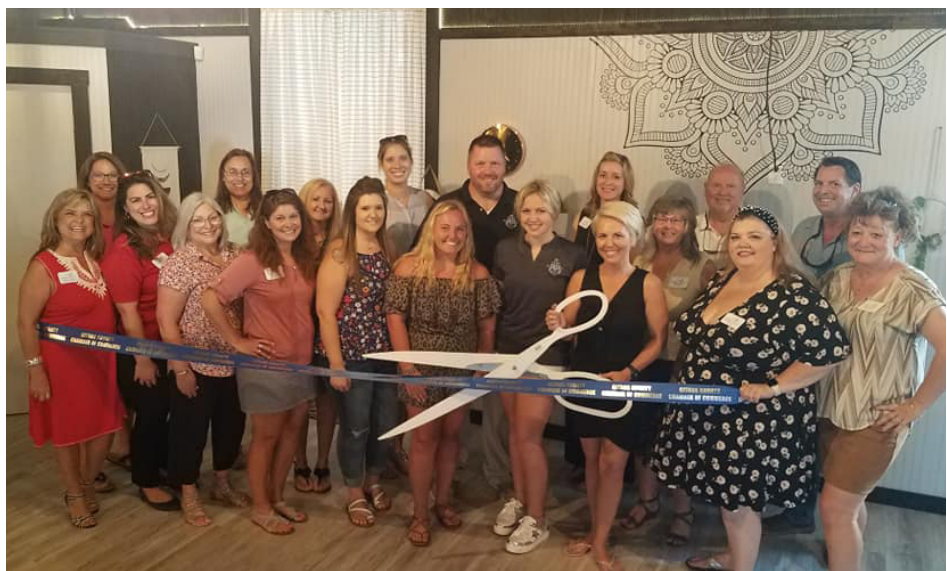
Welcome to the Chamber, Rustic River Boutique and Yoga Studio! 717 NE 5th St, Crystal River. Shop their Boutique and join them for a relaxing session of Yoga!

RPG Screening and Pool Services 352-212-1719