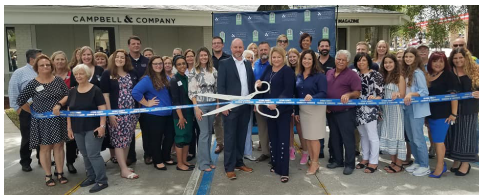
Welcome to the Chamber, Campbell and Company! 2202 Hwy 44, Inverness. Their team helps put you at ease by reducing complex financial concepts to simple, meaningful terms. They view your relationships as ongoing partnerships, and strive to provide you with quality tax and financial advice.