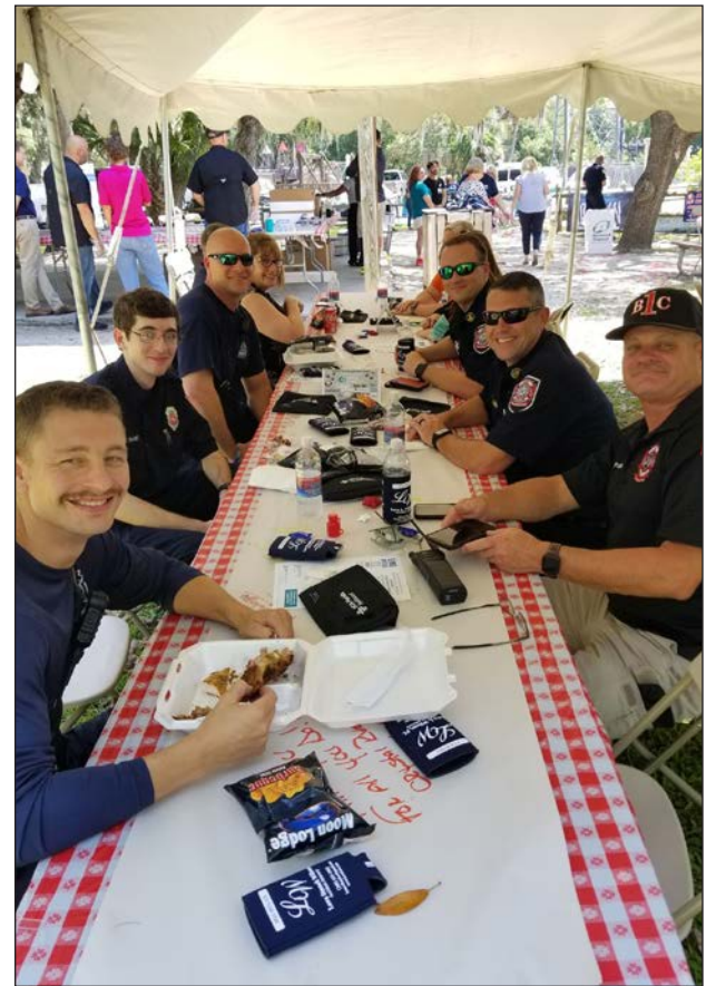
Food Sponsors: M&B Dairy, CoreCivic, Bravera Health Seven Rivers, Joe's Family Restaurant, Ag Alliance of Citrus County, MIKE SCOTT PLUMBING, HCA Florida Citrus Memorial Hospital, and Bubbaque's BBQ – Crystal River.

We would also like to thank our amazing volunteers from the Citrus County Chamber Ambassadors and the Citrus County Chamber Business Women's Alliance.