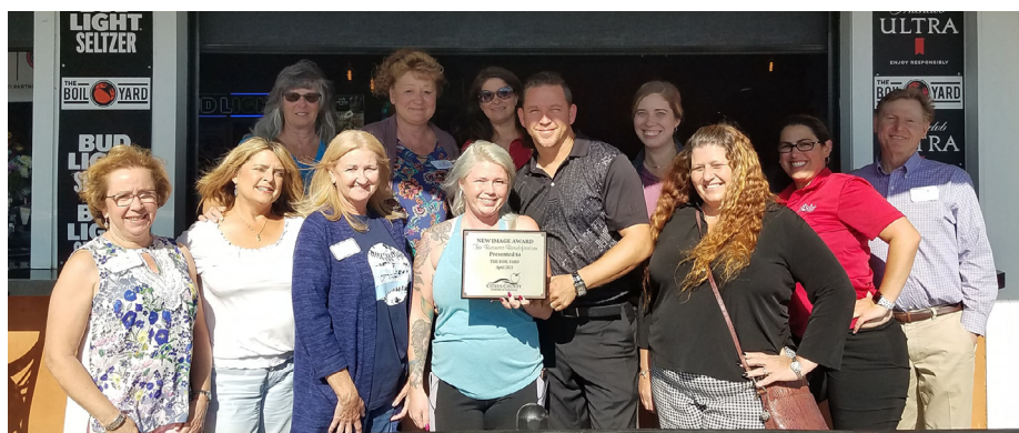
Congratulations to The Boil Yard, in Crystal River, on receiving the April New Image Award presented by the Chamber Ambassadors. The New Image Award is handed out each month to a local business that has made a significant change, visually, to their storefront that impacts the overall appearance of our community.