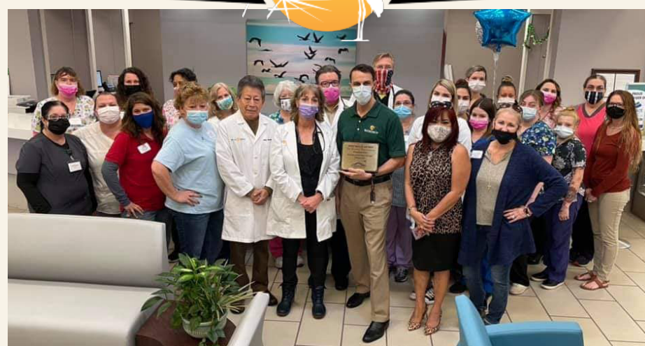
Congratulations Nature Coast Health Care on winning the February Chamber New Image Award!