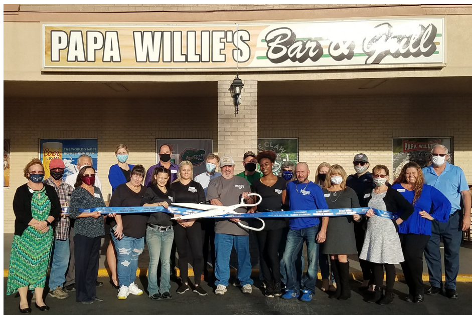
Welcome, Papa Willie's Bar & Grill located at 4105 N Lecanto Hwy, Beverly Hills (same plaza as Pinch A Penny). Call to place your order for great home-style cooking! Also, daily lunch & dinner specials! Serving chicken wings, calamari, oysters, peel and eat shrimp, pizza, pasta, burgers, and more!