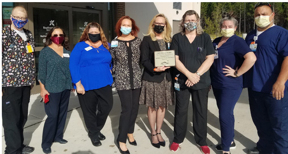
The Chamber would like to congratulate the January New Image Award winner, Bayfront Health ER Citrus Hills and thank them for their investment in our community!