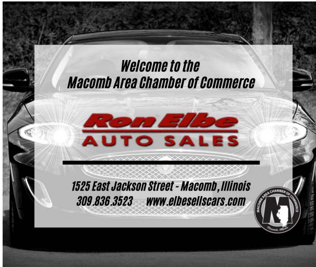
Ron Elbe Auto Sales