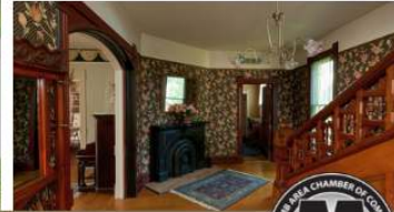
Welcome to the Macomb Area Chamber of Commerce