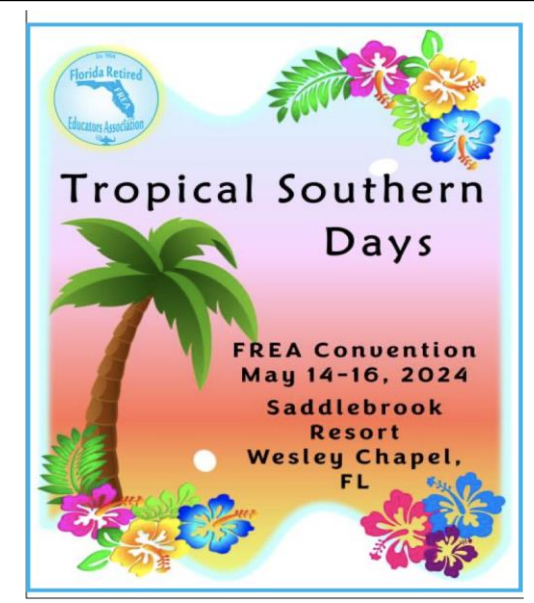
Don't forget -- Save the Date!

Managing Mental Health Through Joy and Satisfaction