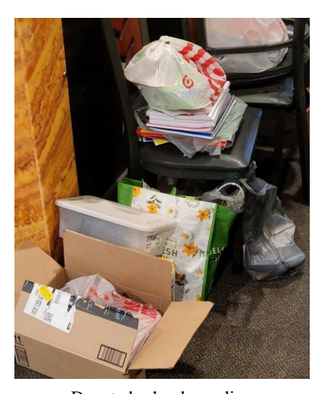
Donated school supplies