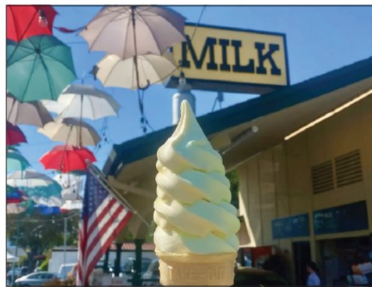
The soft-serve ice cream cones at the Dairy are a popular treat with vanilla, chocolate, orange and strawberry available year round. Additional flavors are also introduced on a weekly basis.