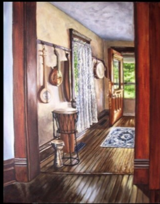
Featured Artist Bonie Bolen