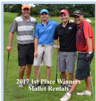
2017 1st Place Winners Mallet Rentals