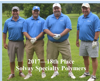
2017—18th Place Solvay Specialty Polymers

($75 per person) in Marietta Bucks or Golf Pro Shop Gift Certificates.