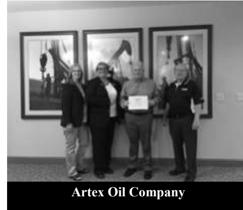
Artex Oil Company