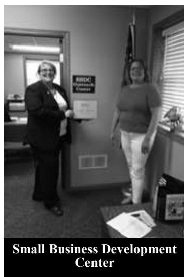
Small Business Development Center