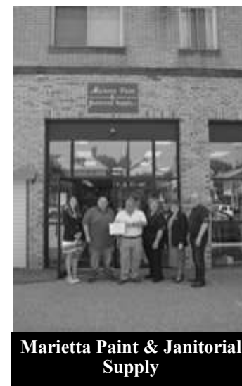
Marietta Paint & Janitorial Supply