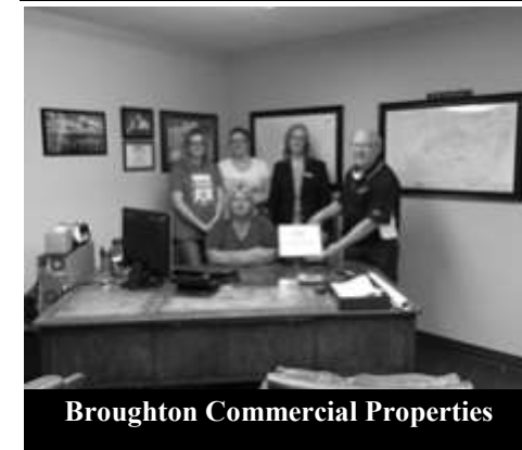
Broughton Commercial Properties