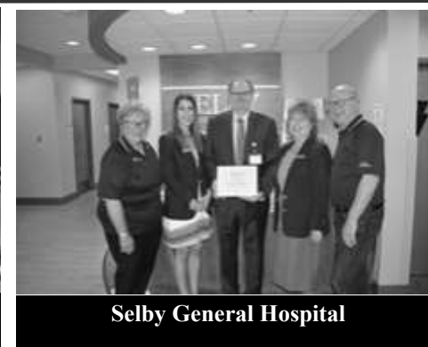
Selby General Hospital