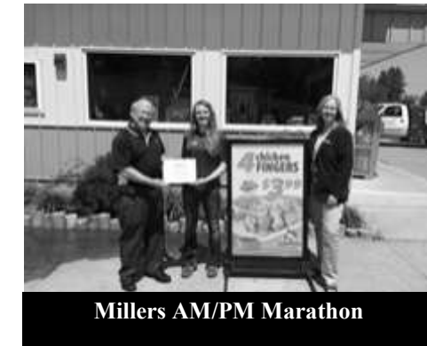
Millers AM/PM Marathon