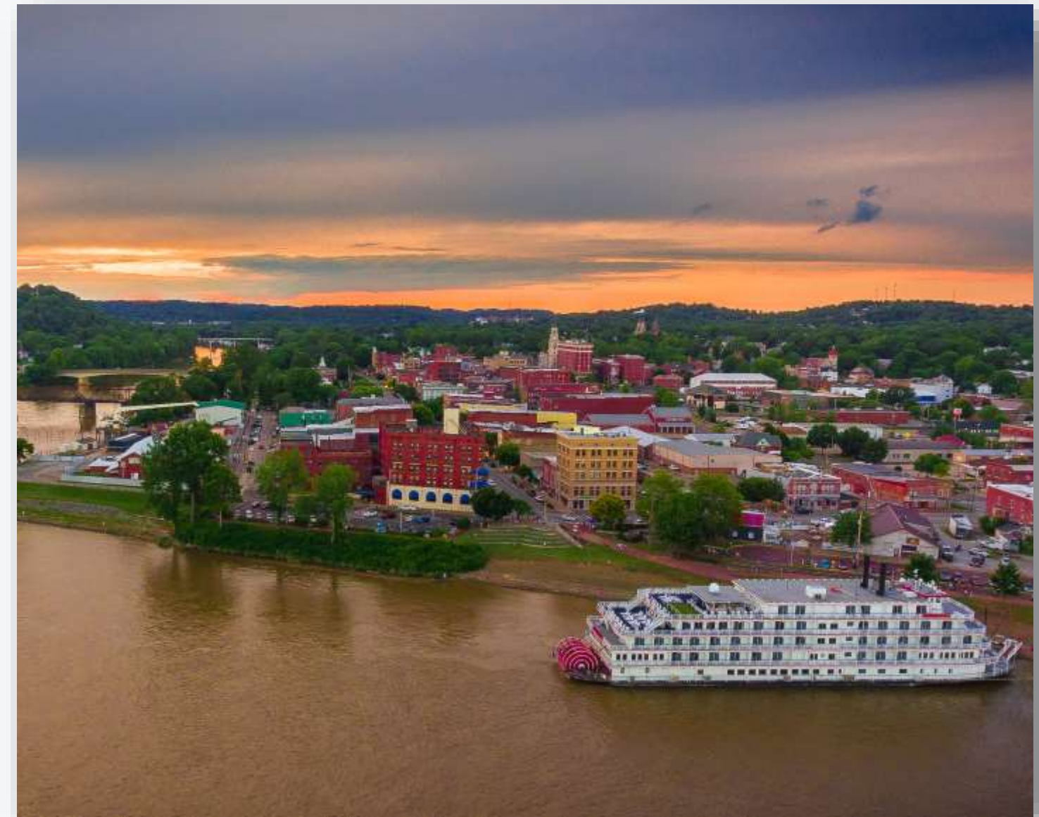
The Queen of the Mississippi docked on the Ohio River Levee in July. Over 100 visitors enjoyed Marietta and its history multiple times last month.