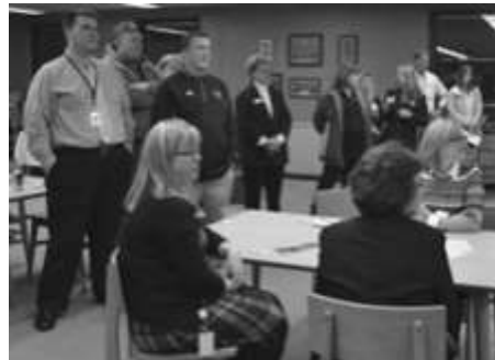
Guests anxiously wait to hear if they won a door prize.