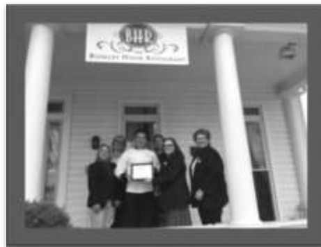
The Buckley House Restaurant