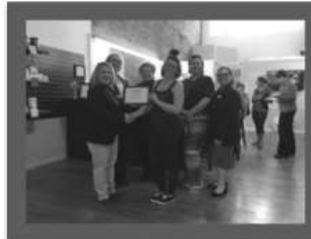
Healthy Start Nutrition