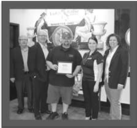
Undo's on the Pike