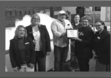
The Foam Garage