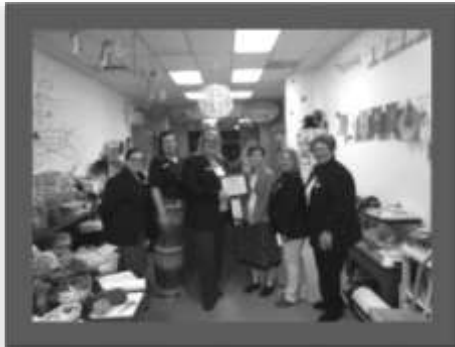
Peddler of Dreams Art Space