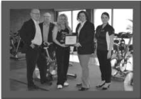
Marietta Boot Camp